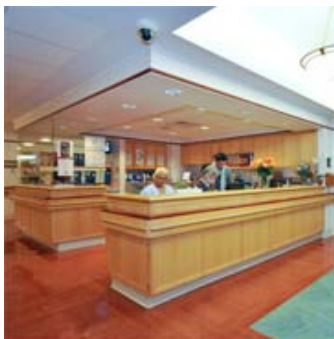
Calvary Hospital Satellite at Lutheran Medical Center, Brooklyn, NY