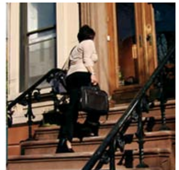
Service to the community at Calvary Hospital. . . . and Calvary@Home